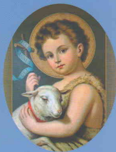
Patron St. John The Baptist